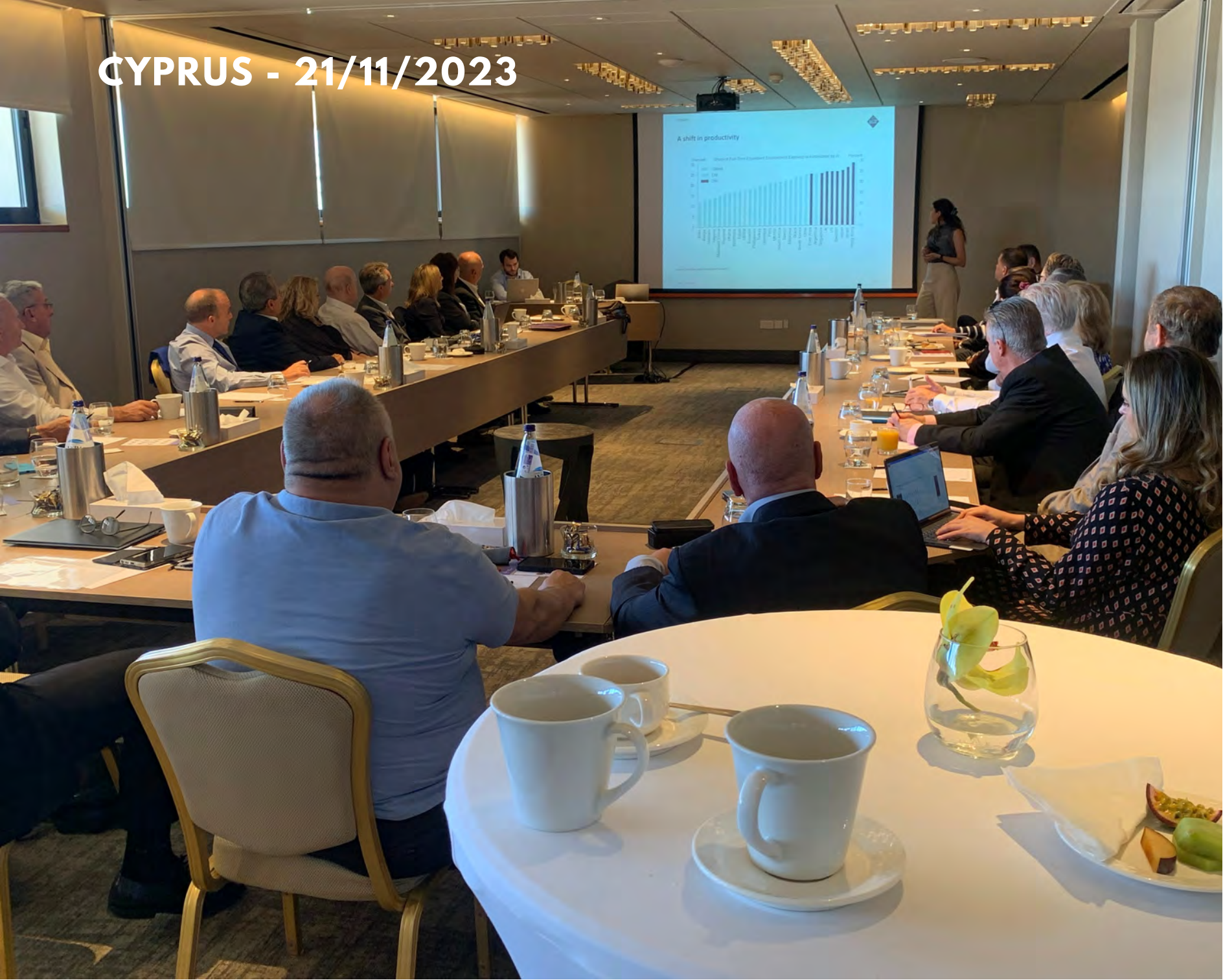
A shift in productivity